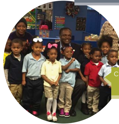
Children at Majestic Youth received a visit from Monroe Mayor Jamie Mayo during Community Workers' Week.