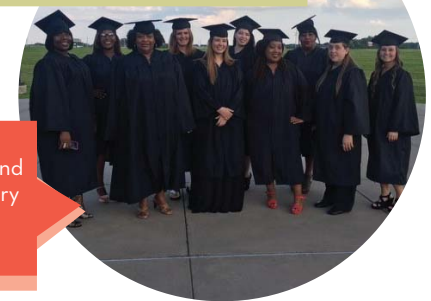
Children's Coalition Institute held commencement ceremonies for its second cohort of graduates to earn their Ancillary Teaching Certificate at Louisiana Delta Community College.