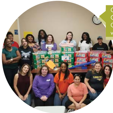
Childcare Pre-K teachers received STEM Grants, funded by School Readiness Tax Credits & were given kits to implement what they learned in their classrooms.