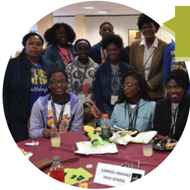
Students & faculty from Carroll Magnet High School enjoyed leadership training during the 2017 Ouachita Youth Summit.