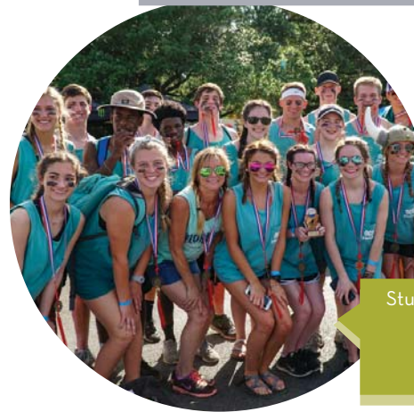
Students from 11 middle and high schools in the region join together to row in the 2018 First National Bank Bayou DeSiard Dragon Boat Races.